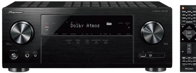
* Image after Dolby Atmos firmware update

Upgrade your home entertainment to the next level with Pioneer's VSX-832, the first 5ch AV receiver supporting Dolby Atmos®. Enjoy a wide, enveloping soundscape with the Surround Enhancer. Ultra HD video, HDR10, HLG (Hybrid Log-Gamma) and Dolby Vision™ present life-like images, while FlareConnect™, Chromecast built-in, and DTS Play-Fi® let you stream music anywhere in the house. Limitless songs on internet radio and network streaming services are just a few taps away with the Pioneer Remote App.