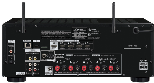
VSX-832(B) UPC: 889951000839