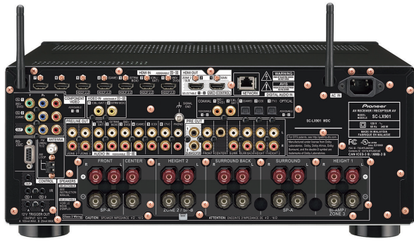
SC-LX901 (B) UPC: 889951000198